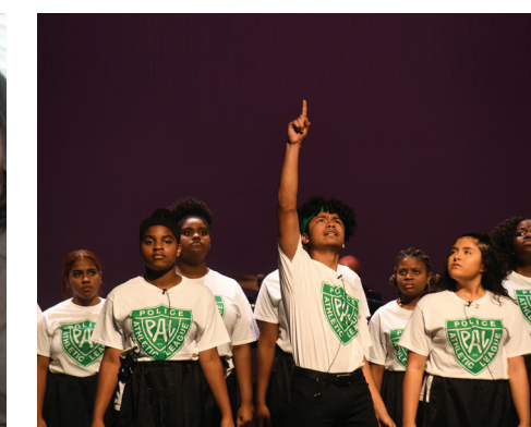
Youth from the PAL Acting Program perform a musical number from Hamilton