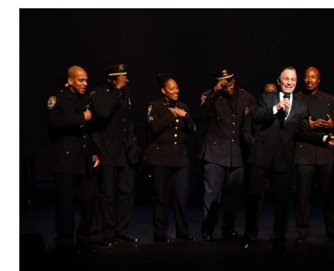
Tony Danza, NYPD officers from the PAL Cops, Kids Chorus