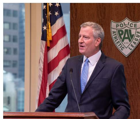
Mayor Bill de Blasio