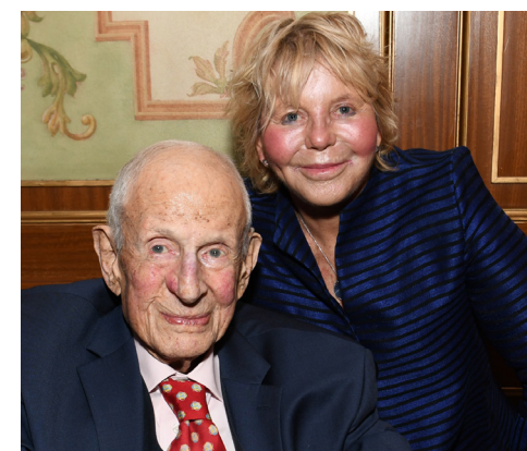
Robert M. Morgenthau, Lucinda Franks Morgenthau